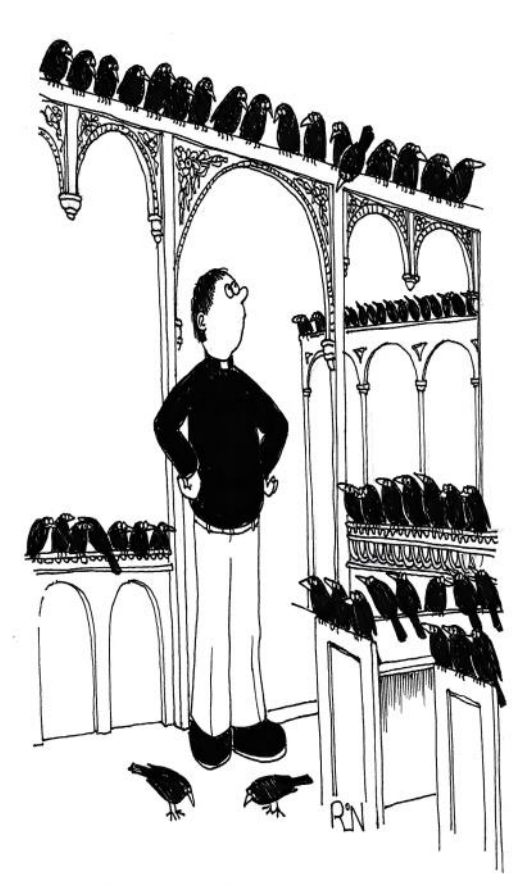
Where was the social distancing?