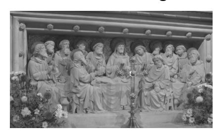
Sunday 3<sup>rd</sup> March 10:30am Holy Communion, Cobham

Sunday 10<sup>th</sup> March 10:30am Mothering Sunday Service, Luddesdowne