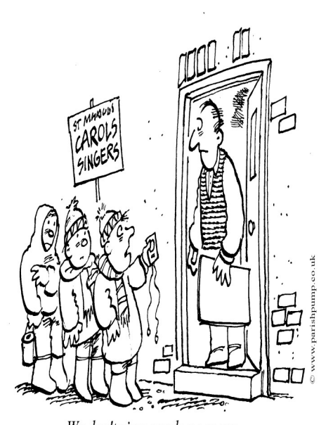
We don't sing carols no more... you 'ave to listen to 'em off me iPod!